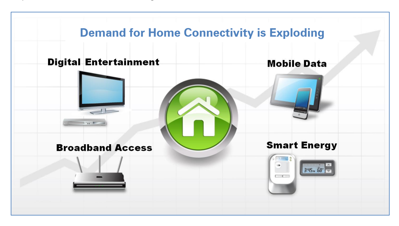
Figure 2 – Demand for Home Connectivity is Exploding

Home networks are now expected to support applications such as whole-home audio systems, interactive gaming, Smart Grid utilities management and security monitoring. The rise of HDTV, IPTV and multi-room HD DVR services are significantly raising the throughput requirements for home networking.