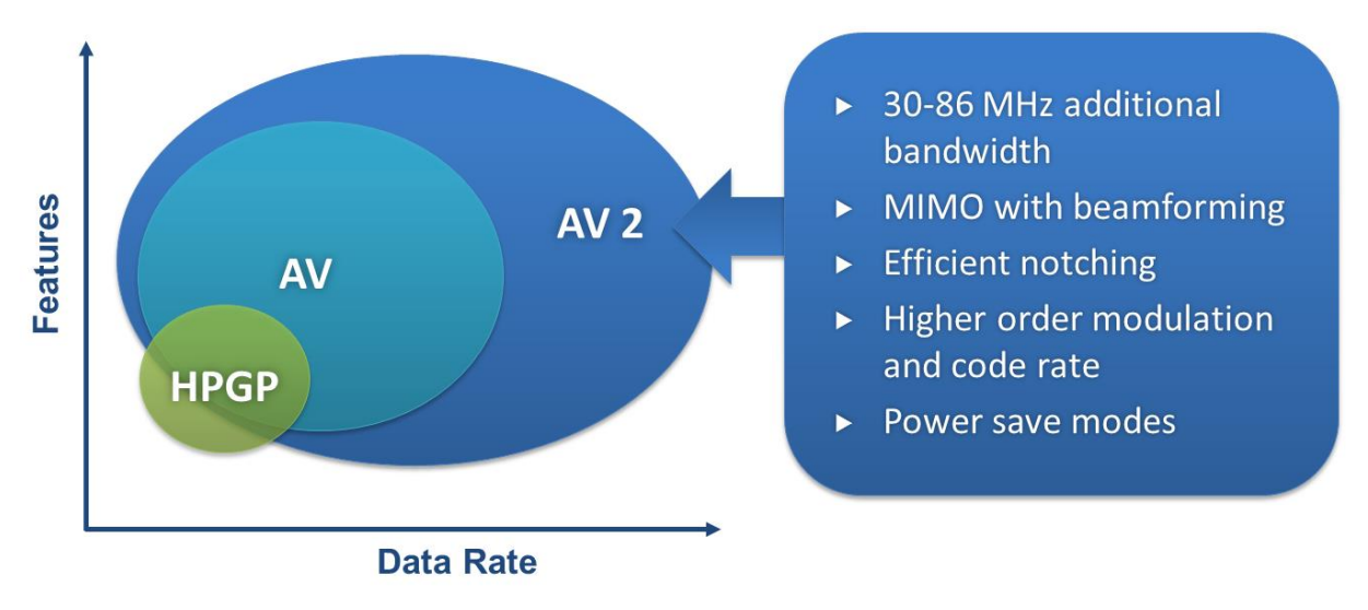
Figure 5 – Key Differences in HomePlug AV2

In addition to the compatibility between HomePlug AV and HomePlug AV2, there are a number of characteristics that differentiate HomePlug AV2 and provide for its higher bandwidth and coverage capabilities. These enhancements are shown in Figure 4 and are described in the following sections.