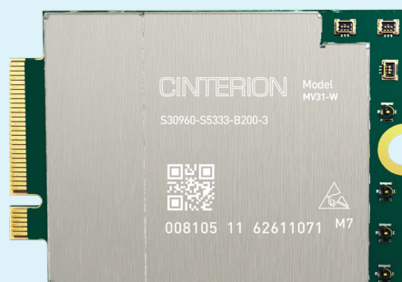
42mm x 30mm x 2.5mm M.2